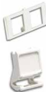
MX-SMB-MM-XX)..... 2-Port multimedia bezel